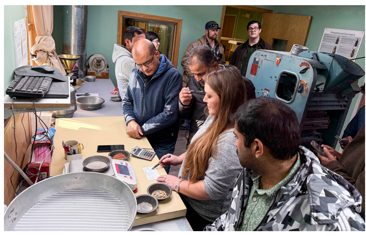
India Sorghum Feed Manufacturing and Poultry Nutrition course participants visited the Concordia Terminal in Concordia, Kansas, to learn how commodity crops are moved through the supply chain prior to export.

Flour Milling for Wheat Commissioners and Staff